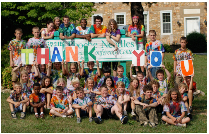
THANKS to the many folks who contributed to the Summer Camp Scholarship Fund and made it possible for so many youth to attend residential and day programs this summer.